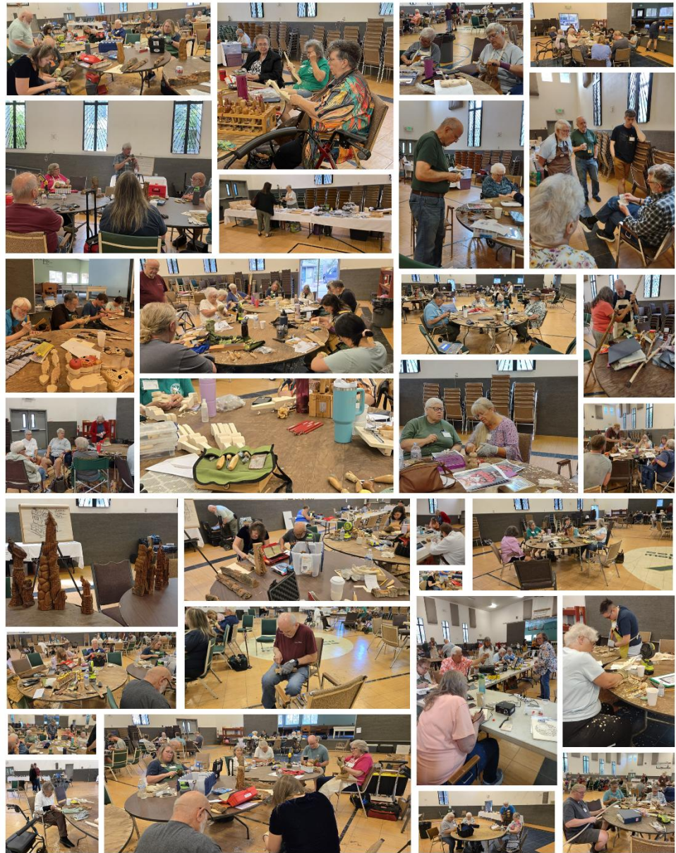
Image Collage from 2025 Oregon Woodcarvers Rendezvous