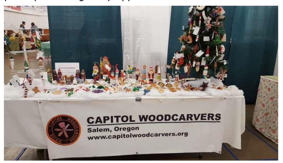
Club Ornament Sale Table

This is our club's only fund-raising event and member participation is greatly appreciated.