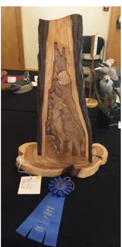
Happy Carving! Article submitted by: Cheryl Ayres