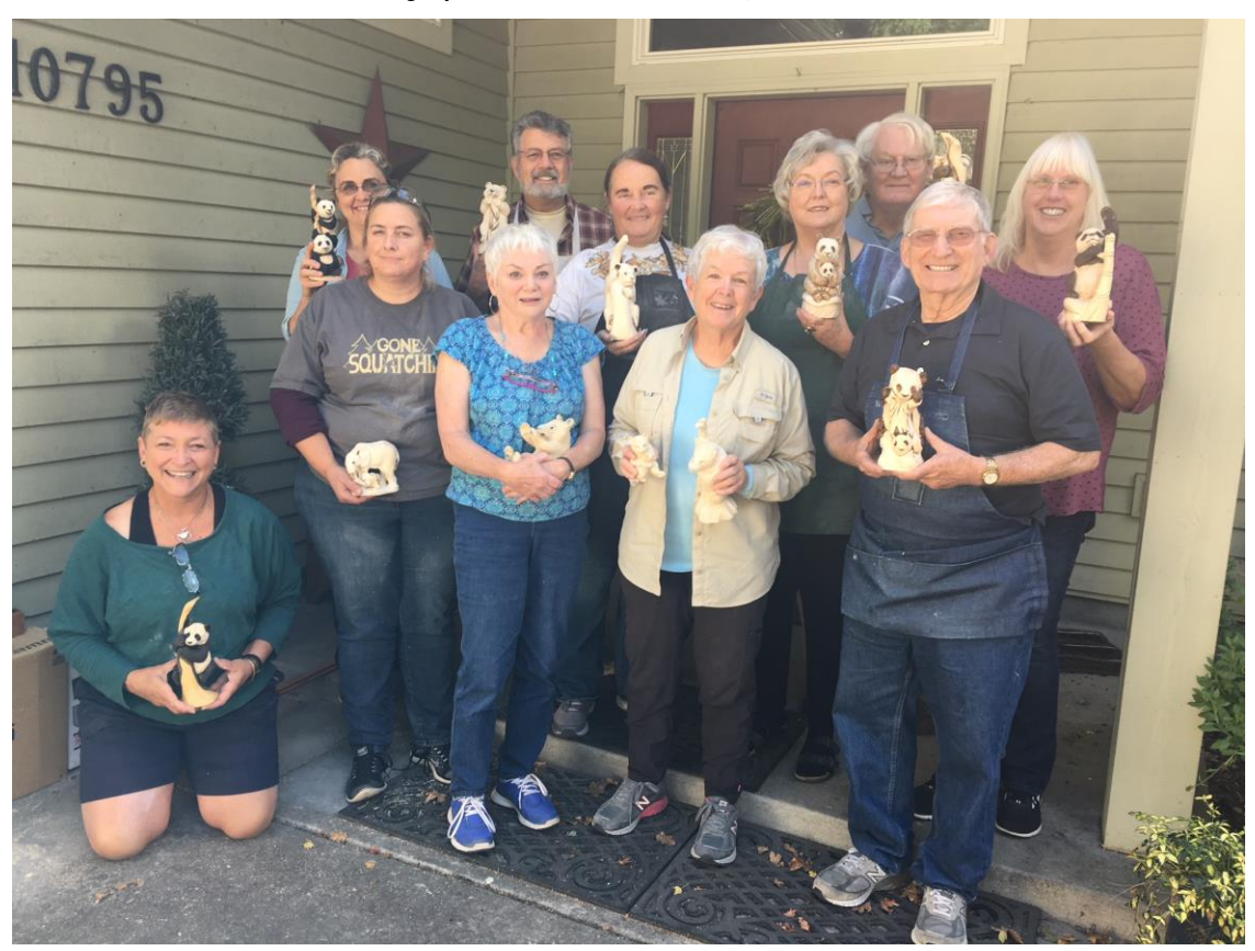
Article submitted by: Don Fromherz

After four days of flying chips, some amazing pieces emerged from those blocks of wood. Visit: hajny.fineartworld.com, to see some of her works.