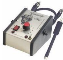
SK Burner with Fixed #1L Pen