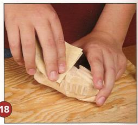
Sand. Sand the surface of the frog with 220- and then 320-grit sandpaper. Clean the surface of your carving before painting.