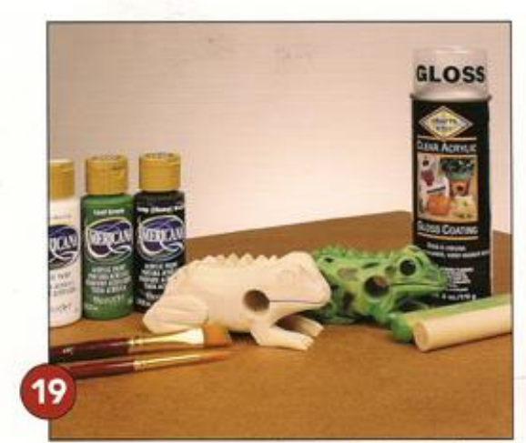
Paint the Frog. Paint the frog and the dowel. After the green and black paints dry, spray the surface with a gloss varnish. Frogs look wet, and the gloss varnish will give your frog a wet look. (Follow the manufacturer's instructions when using spray paint.)