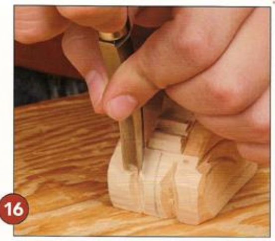
Shape the Back Legs. Remove wood with the V-tool to shape the back legs.