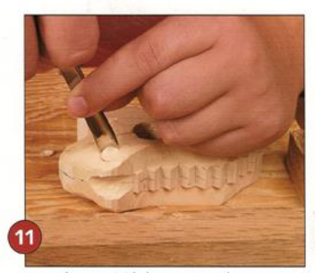
Carve the Eyes. With the gouge, use plunge cuts to form the eyes.