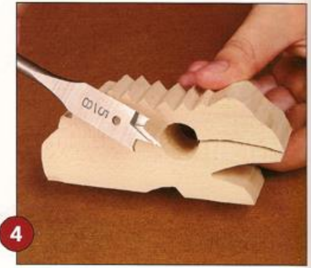
Drill the Hole. Have someone drill the hole with an electric drill with a %" (1.6cm) spade bit and cut the mouth with a band saw.