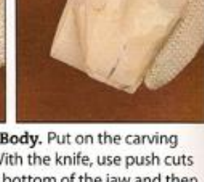
Round the Jaw and the Body. Put on the carving glove and thumb guard. With the knife, use push cuts and pull cuts to round the bottom of the jaw and then the body.