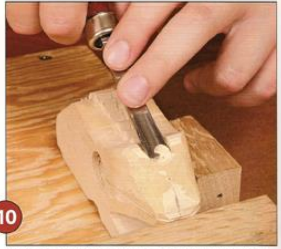
Shape the Eye Area. Working on your carving table, use a #9 %" (10mm) gouge to remove wood at the top of the head between the eyes.