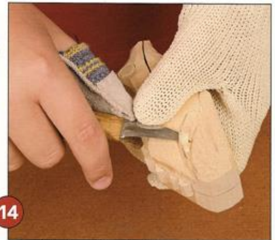
Round the Legs. Round and shape the legs using the knife. Be sure to wear your carving glove and thumb guard.