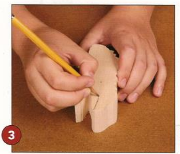
Draw the Mouth. Mark where the center of the drill hole will be, and draw in the mouth. Use a coping saw to cut the mouth into the carving or...