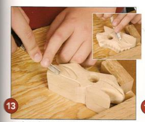
Cut the Back Legs. Use a V-tool to cut in the back legs. Then, use the gouge to remove wood from around the legs so they stick out farther than the frog's body.