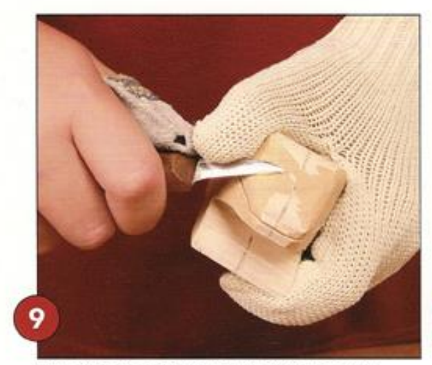
Round the Face. Round the top of the face with the knife.