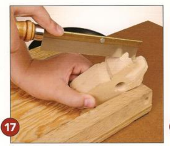
Separate the Front Legs. With the backsaw, cut between the front legs to separate them. Then, use the knife to shape them.