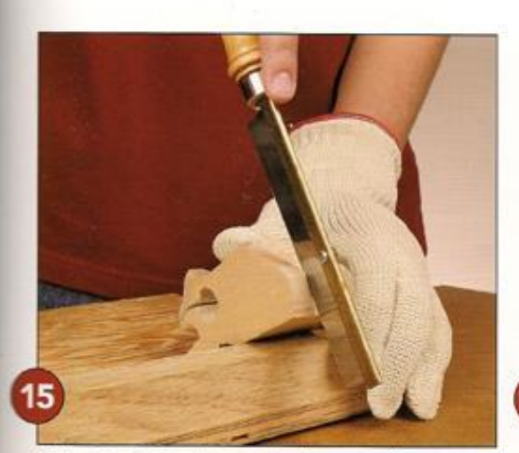
Make Stop Cuts. Use your backsaw to make stop cuts to shape the back of the legs.