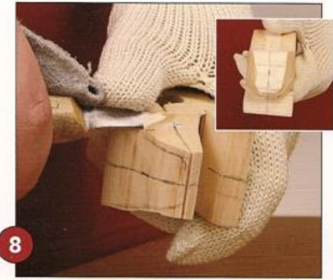
Draw and Round the Head. Draw the shape of the head so it's balanced on both sides. Then, round the head with the knife.