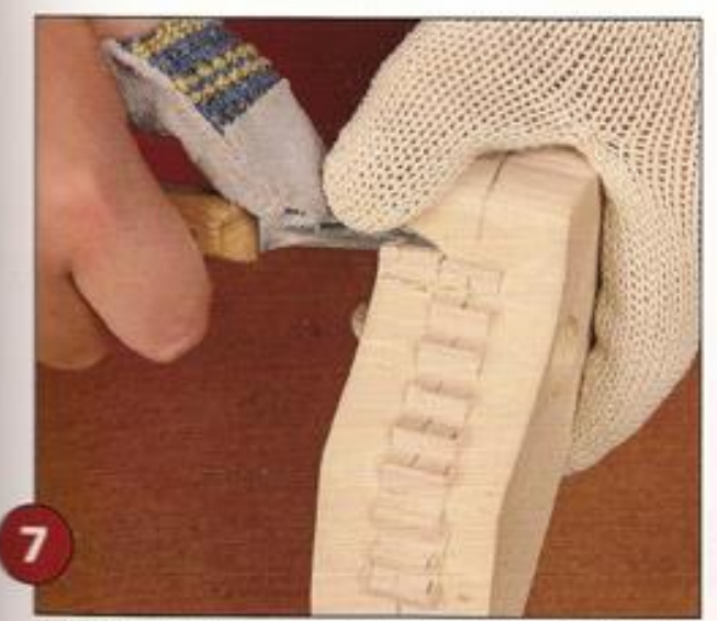
Carve the Back. Put on a carving glove and a thumb guard, and using a fixed-blade knife, carefully remove wood from both sides of the ribs using push cuts and pull cuts.