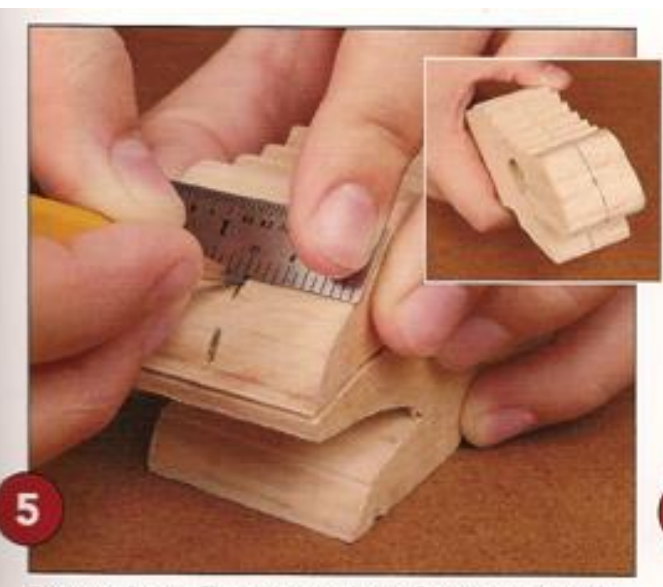
Draw a Centerline. Use a ruler to find the center of the frog. Draw a centerline all around the frog to use as a reference.